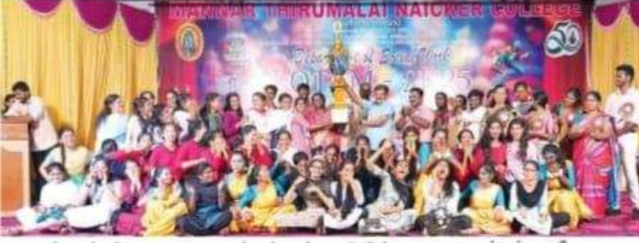
மன்னர் திருமலை நாயக்கர் கல்லூரியில்